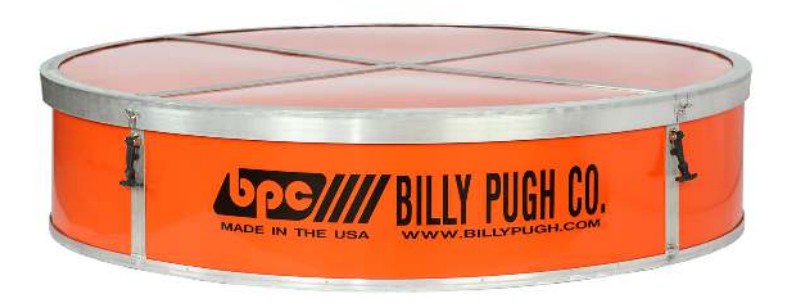
Personnel Net Box