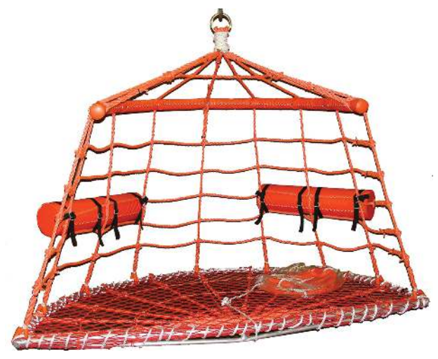
Boat Rescue Net

The BPC X-544 is a boat davit or crane launched rescue system. Safe and effective for retrieving man overboard operations with the option of not putting a rescue swimmer in harm's way.