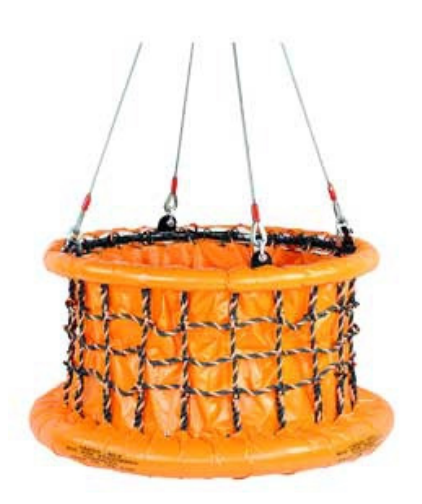
Collapsible Cargo Basket

The collapsible work basket is a lightweight man basket for applications where OSHA requirement is not applicable.