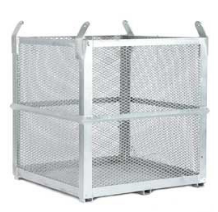
Rigid Cargo Basket

The DB-1 Derrick Basket is made for lifting personnel with a lightweight basket and retractable lifeline attached to fall protection harness.