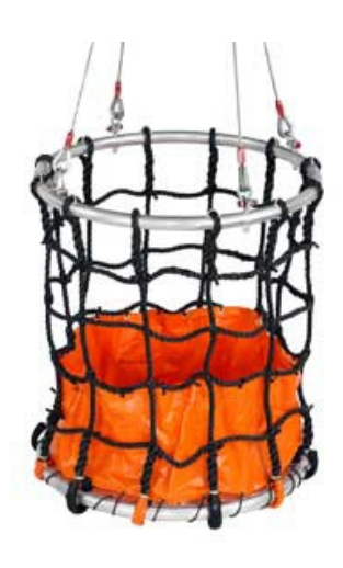
Personnel Work Basket

The collapsible work basket is a lightweight man basket for applications where OSHA requirement is not applicable.