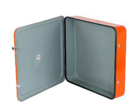
Ring Buoy Box