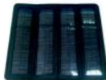
SL-SOLP Solar Panel