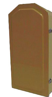
Breathing Apparatus Box BAB-3