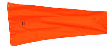
Wind Sock WS-18