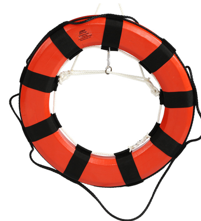
Rescue Ring RR-30