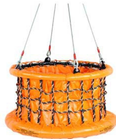
Collapsible Cargo Basket X-8CB

The collapsible work basket is a lightweight man basket for applications where OSHA requirement is not applicable.