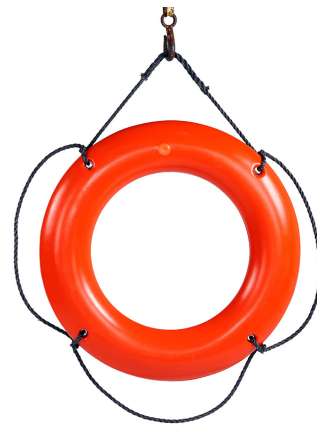
USCG Life Ring Buoy A-301