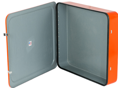
Ring Buoy Box RBB-30