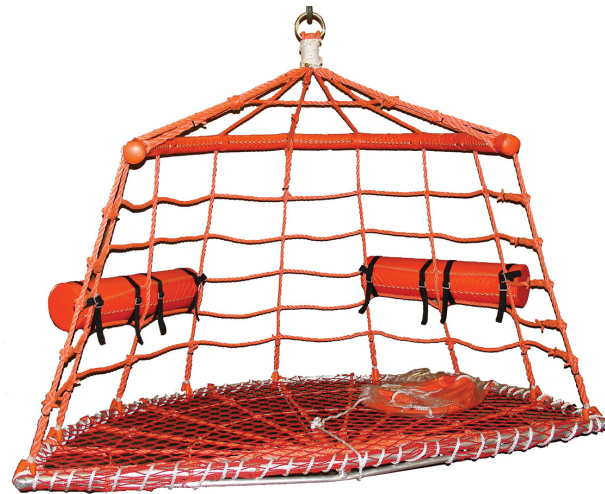
Boat Rescue Net X-544

The BPC X-544 is a boat davit or crane launched rescue system. Safe and effective for retrieving man overboard operations with the option of not putting a rescue swimmer in harm's way.