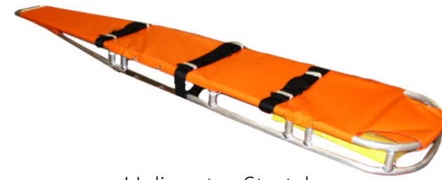
Helicopter Stretcher B-206