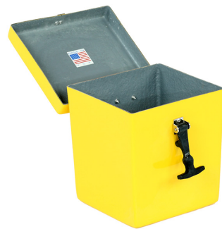
Utility Box UB-1