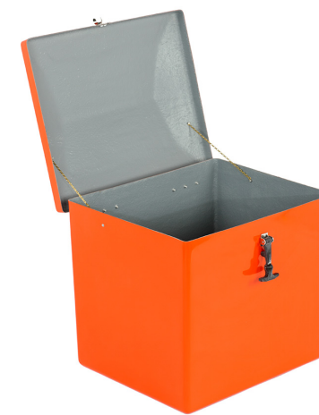
Life Preserver Box LFB-5