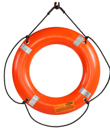
SOLAS Life Ring Buoy A-301S