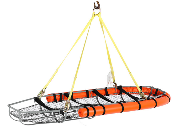
Wire Stretcher S-1