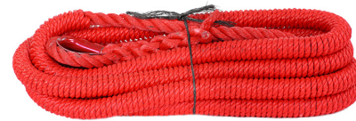
Tag Line PTL-1