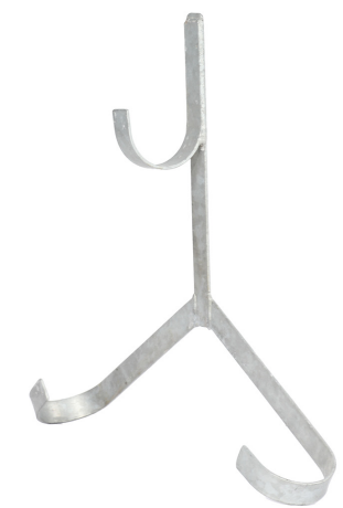
Life Ring Buoy Bracket B-30

Need a Quote today? find us at www.billypugh.com or call (361) 884-9351