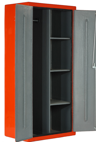
Storage Locker SL-1