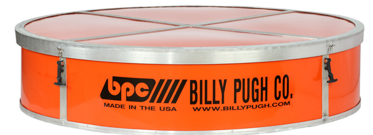
Personnel Net Box PNB-1-4