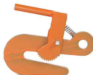
Safety Pipe Hooks SPH-03

Designed to grip pipe or casing for hands free operation.