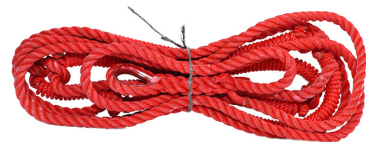
Swing Rope SR