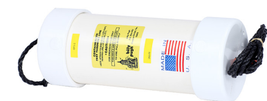
Containerized Fast Throw Line CTL-1