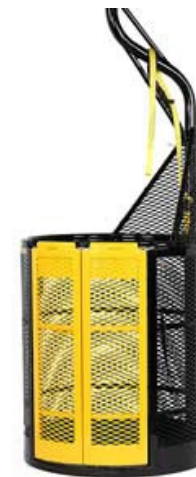
Derrick Basket DB-1

The DB-1 Derrick Basket is made for lifting personnel with a lightweight basket and retractable lifeline attached to fall protection harness.