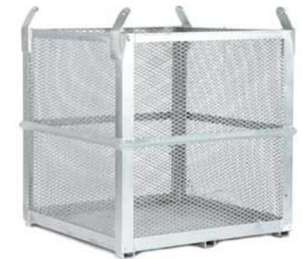
Rigid Cargo Basket 343

The DB-1 Derrick Basket is made for lifting personnel with a lightweight basket and retractable lifeline attached to fall protection harness.