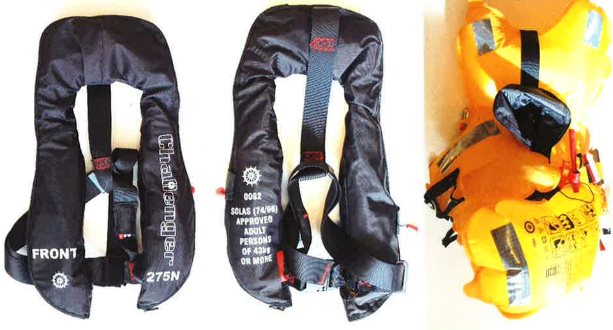
Lifejacket model: Challenger Interlock 275 Twin Chambered Inflatable Lifejacket – Single back strap & larger neck aperture (Product ref.: 064)